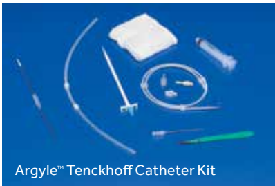
Argyle™ Tenckhoff Catheter Kit