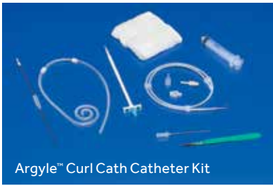
Argyle™ Curl Cath Catheter Kit